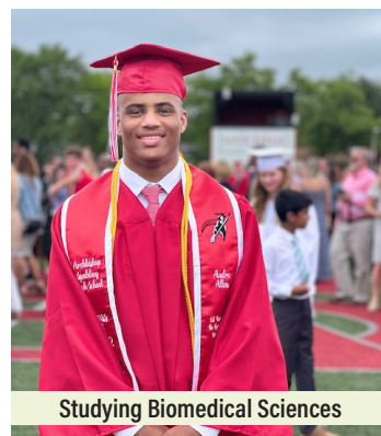
Studying Biomedical Sciences