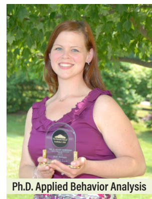
Ph.D. Applied Behavior Analysis