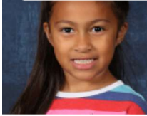
Roadrunner You Rock!