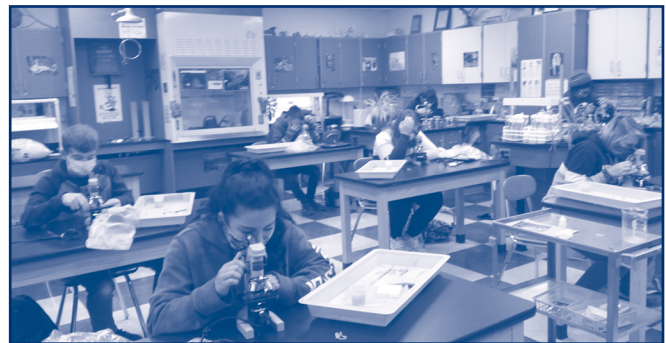
Students work on identification of water organisms.

LaCelle is currently working with students to identify water organisms and to develop methods for analyzing water and stream habitat quality. They hope to send water samples in for DNA testing, through Cornell University's Citizen Science Fish Tracker Project, to look at what species might be in the stream sites.