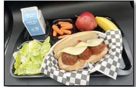
Selah students enjoy fresh farm-to-school meal selections like this homemade bison meatball sub.

tious local selections. Grant funds support districts in procuring high quality, fresh, and culturally relevant foods for their meal programs from local farms, and promoting items that are grown and raised in Washington. Also, students have been participating in farm to school efforts by partaking in activities related to agriculture, food, health and nutrition as well as taking part in made from scratch menu taste tests.