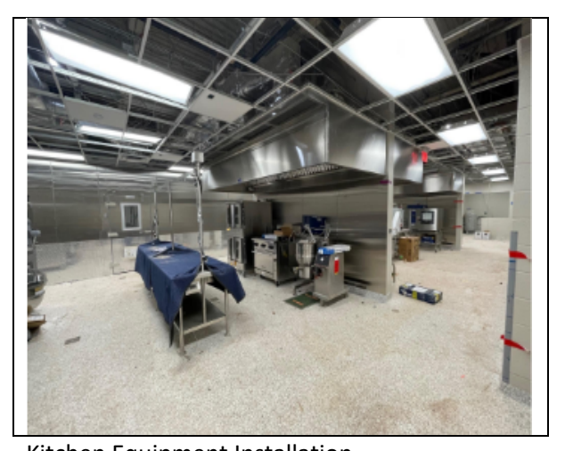
Kitchen Equipment Installation