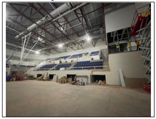
Competition Gym Fixed Seating