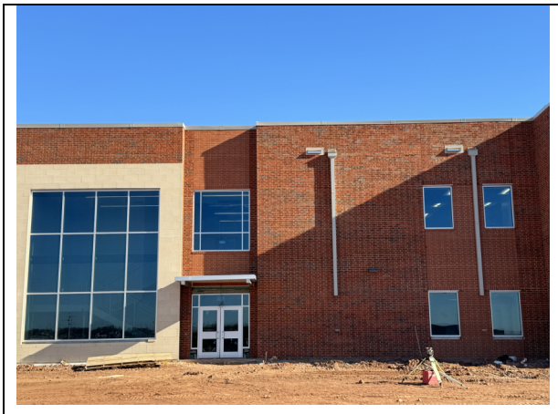
Area C/D Exterior