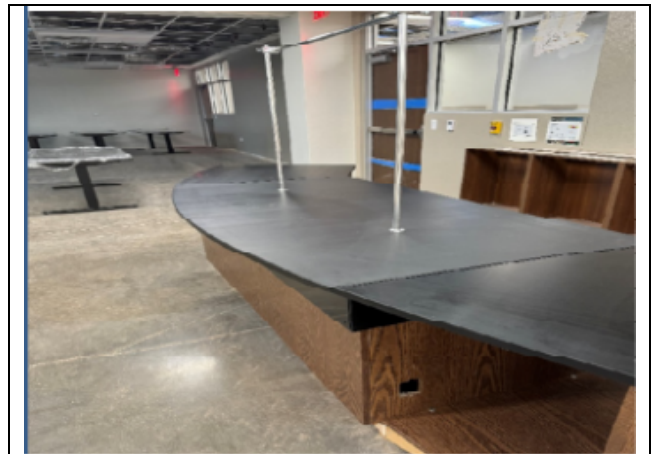
Science Lab Counters