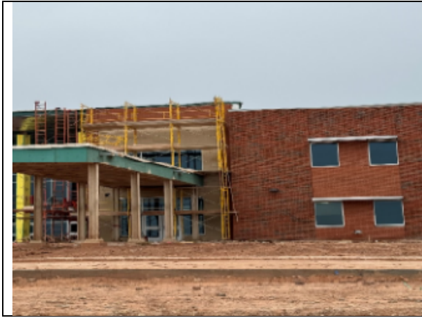
ACM Panels Main Entry