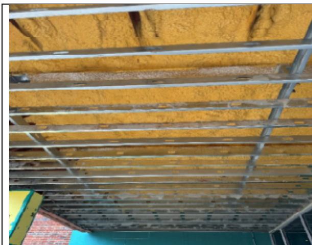
Exterior Soffit Framing