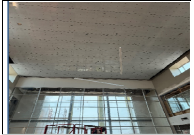
Main Commons Lighting