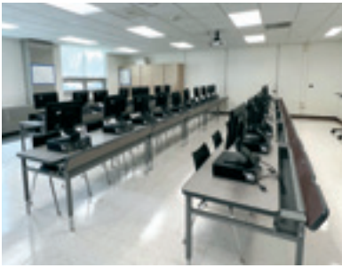
The remodel of the tech ed spaces includes a computer lab.

completed. This phase also included the purchase of new welding equipment, a sheet metal shear, and a press brake, purchased through support of donors at the Centennial Area Education Foundation's spring gala.