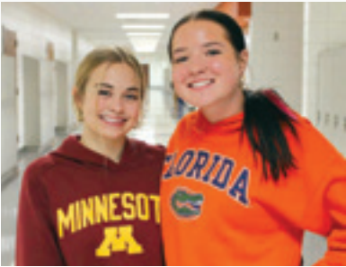
High School families engage in several events at the school, centered around post-secondary education opportunities.

The District is in need of substitute teachers, paraprofessionals, food service, custodial, and Kids Club