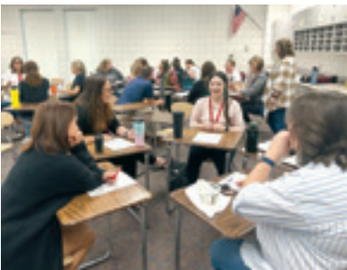
Paraprofessionals at Centennial Middle School participated in "Play to Your Strength" training in preparation for the new school year.

Paraprofessionals at Centennial Middle school geared up for the new school year by participating in a "Play to Your Strength" training where they learned how to create opportunities for students and staff to speak about their own strengths, focus on self-awareness, confidence and engagement, build healthy relationships, and the ability to imagine possibilities.