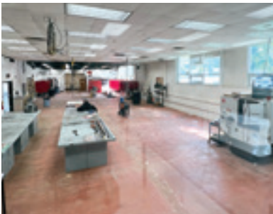
Remodeled spaces are setting the stage for new courses in the metals manufacturing pathway.

The Centennial High School manufacturing tech ed classrooms were modified over the summer to make way for additional equipment and space to enhance the learning environment. Walls were removed to open up the space and sightlines, ceiling and floors were upgraded along with ventilation. A garage door was added for the delivery of supplies, and a computer lab expansion was also