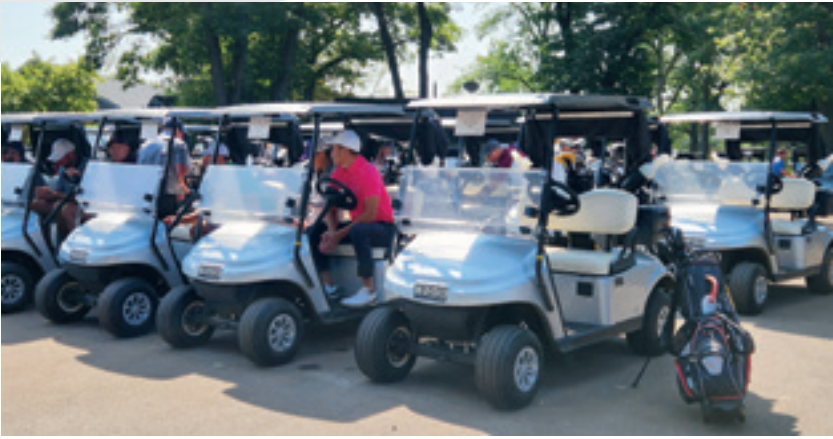
CAEF hosted 32 golfers on September 8 at a fundraiser golf tournament held at Majestic Oaks Golf Course. The money raised will provide five CAEF scholarships to seniors pursuing higher education after graduation!