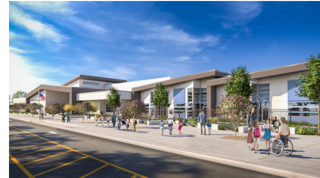
Alders Creek Elementary School