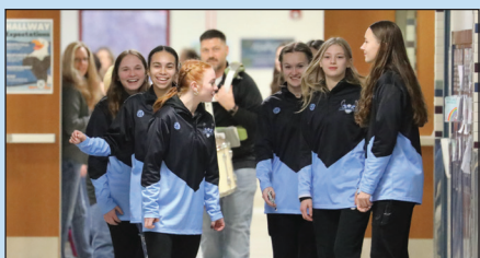
MAKING HISTORY: Girls wrestling hosts Fulton in its first-ever home dual meet.