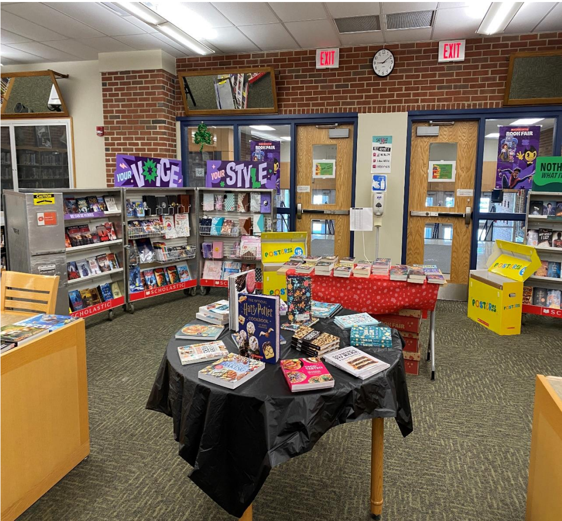
Beautifully displayed books were available for High School students to browse throughout the Book Fair.