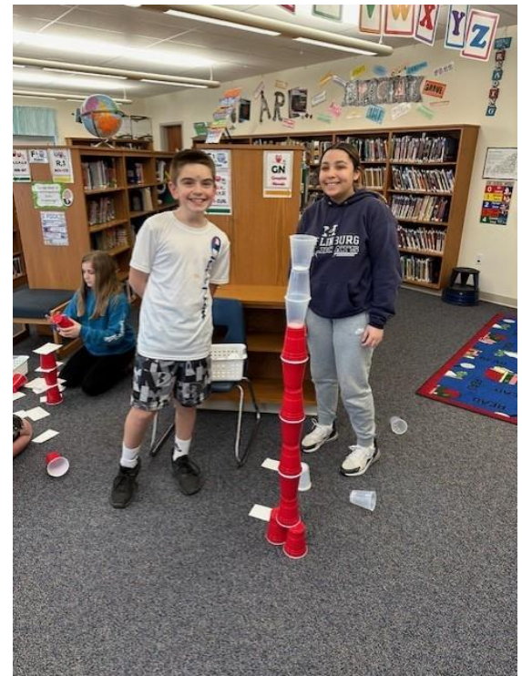
Students enjoying the themed activities.