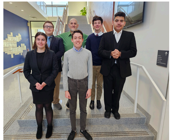
The Newmark Prosecution Team at Mock Trial