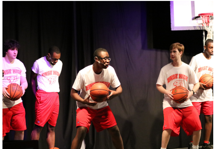
Get your head in the game!