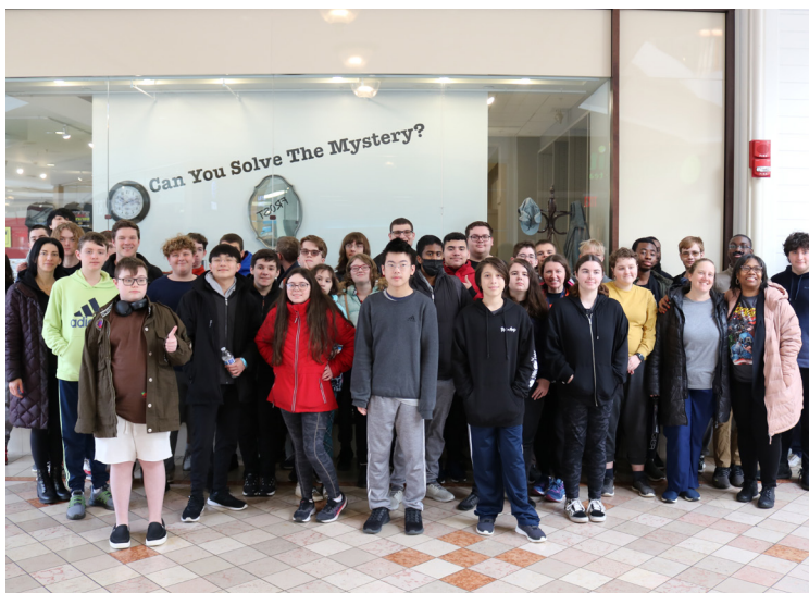
NHS Students visited an Escape Room