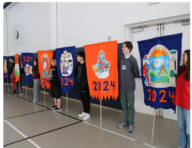
Students at the Coat of Arms Ceremony