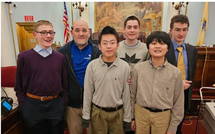
The Newmark Defense Team at Mock Trial

**For more details, check your weekly Friday Backpack News closer to the event dates.