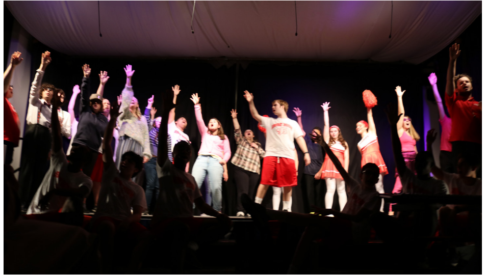
Reach for the stars!