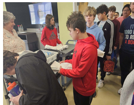
Helping at K-8 school lunch

We encourage all of our students to engage in Community-Based Experience and we look forward to hearing more about their efforts and achievements. More information, nomination deadlines and digital nomination forms can be found on the Newmark website, under “PIN Community Connections.”