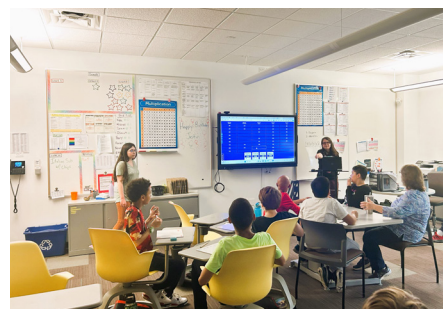
NHS helping in K-8 Classrooms