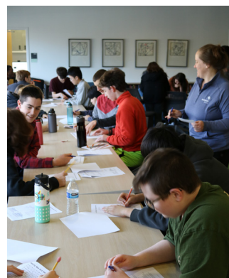
HR 205 trying to solve the 7 Wonders of Newmark