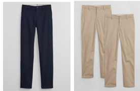
Pants with pockets