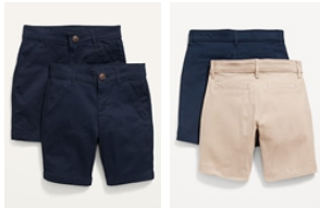
Shorts with pockets