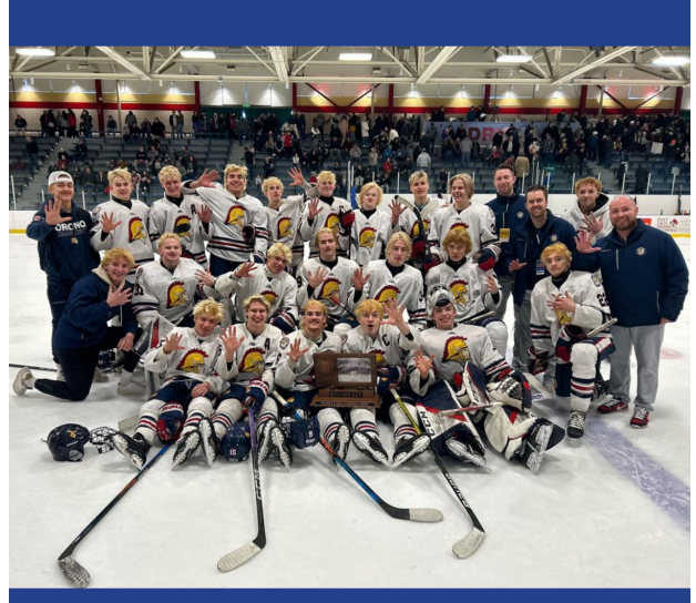
2024 MSHSL Class A Boys Hockey State Tournament Consolation Champions