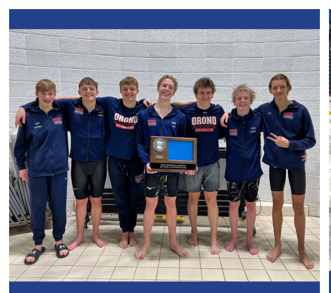
Boys Swimming and Diving State Qualifiers

Be sure to follow AD Brunner's updates on the Orono Spartans Facebook page!