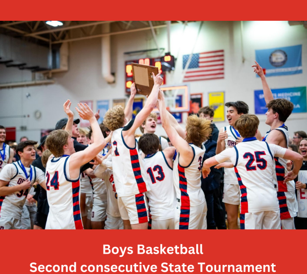
Second consecutive State Tournament appearance and an outstanding 2024 season