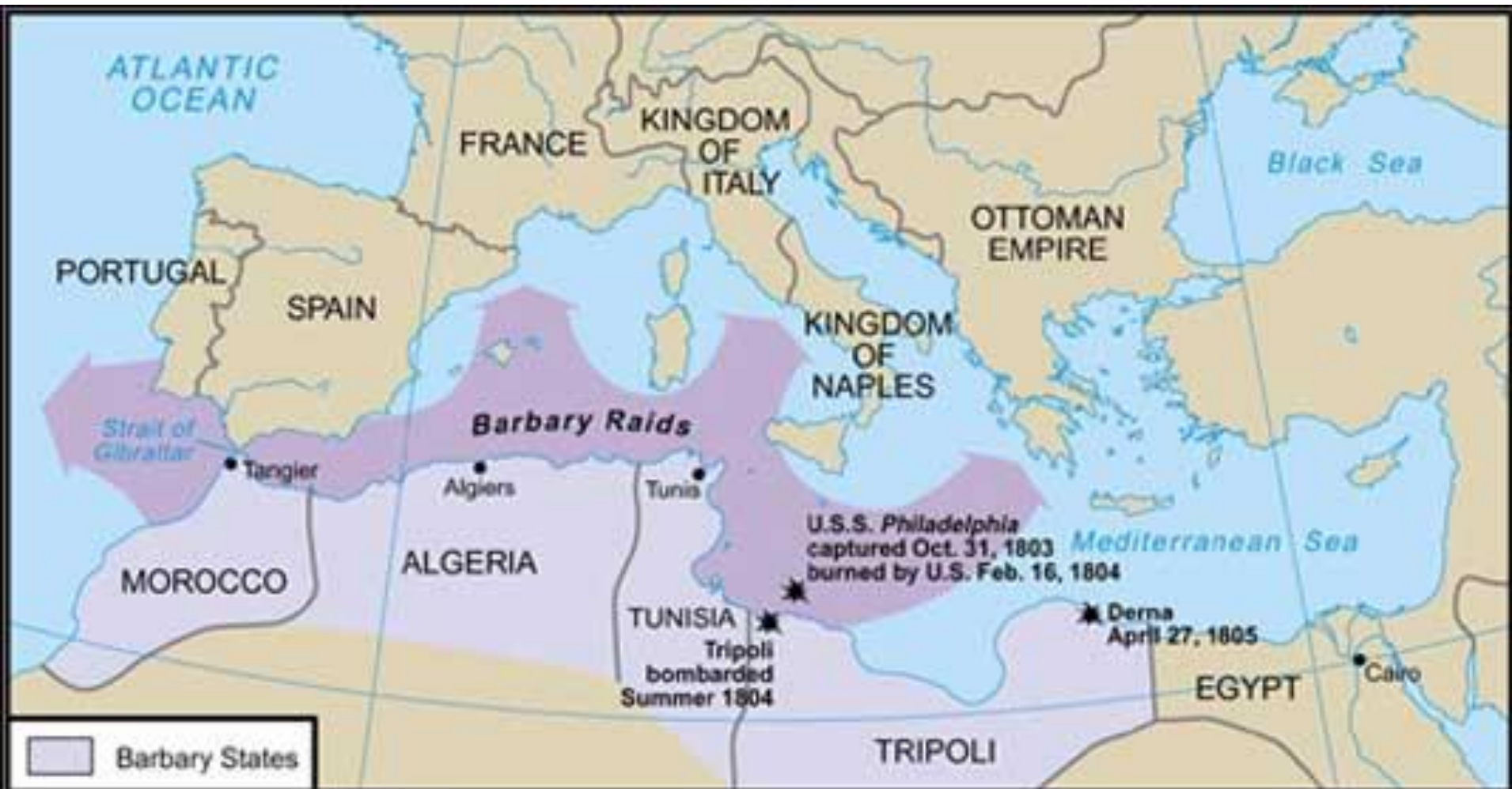
THE BARBARY STATES