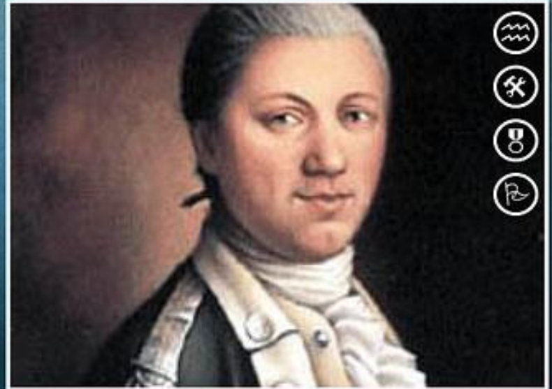
Father of the U.S. Marine Corp

Samuel Nicholas (1744-1790) of Pennsylvania was the first commissioned officer of the U.S. Continental Marines — and considered the first commandant of the Marine Corp — and participated in the Battles of Nassau, Trenton and Princeton.