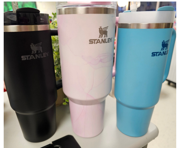
Stanley cups appear in all shapes and sizes and are heavily present at the STPA campus.