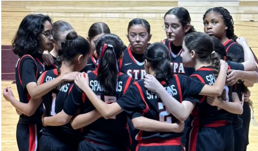
The girls' basketball team huddles up before the State tournament game for one last pep talk.