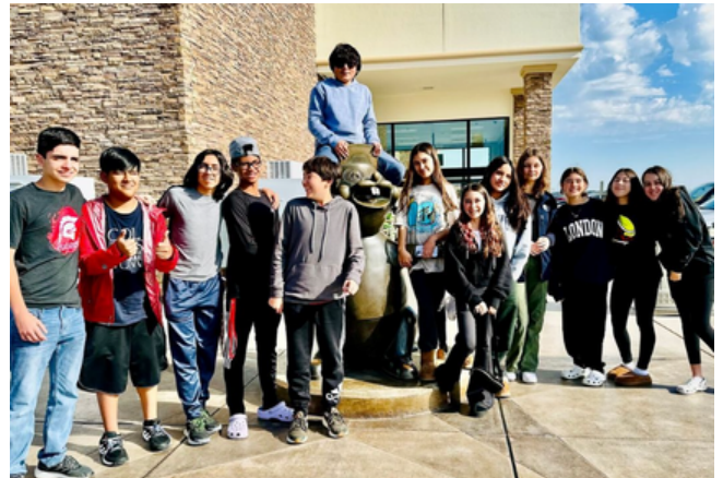
The tennis team poses outside of Buc-ees which has become a school State trip tradition.