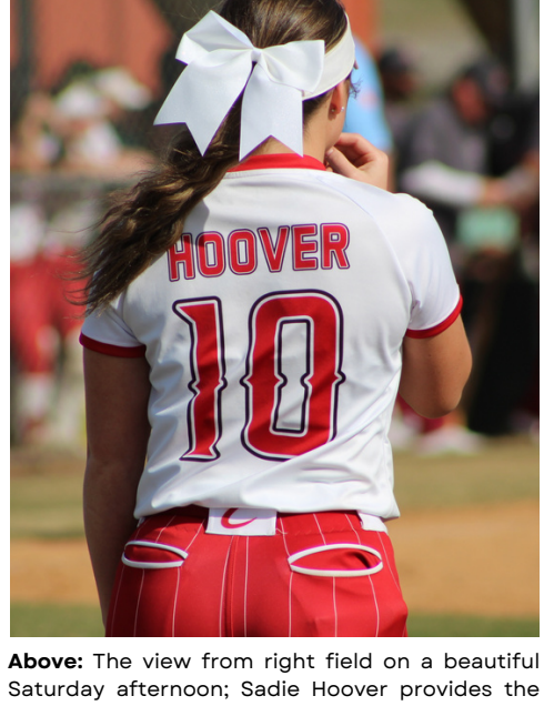
Lady Cavalier defense.