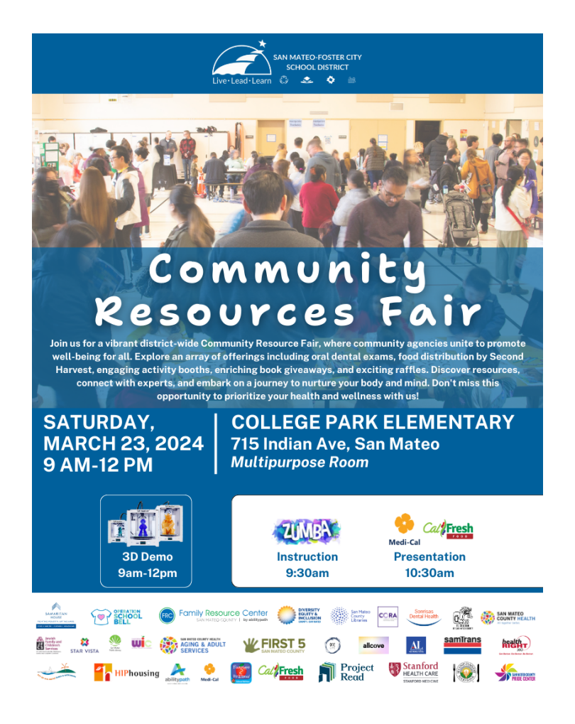
Below is a list of all our providers who will be at our fair:

AbilityPath, Aging Adult Services, Allcove, Assistance League of San Mateo County (includes Operation School Bell), CORA, El Concilio de San Mateo, Faith in Action, First 5 San Mateo County, Footsteps2Brilliance, Healthright 360, HIP Housing, San Mateo Parks & Rec, Medi-Cal / Cal-Fresh, OneLife, Parent Project-San Mateo County Office of Diversity and Equity, Parent's Place, Pride Center, SamTrans, Samaritan House, Second Harvest, San Mateo City Library-Project Read, San Mateo County Library, Sonrisas Dental Health, Stanford Health Care & Medicine, StarVista, WIC