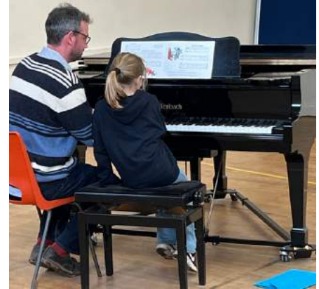
Performing Arts Showcase