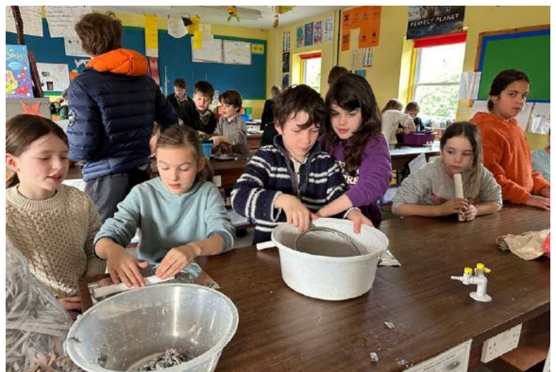
Downe House's STEM-themed Saturday Smash Session