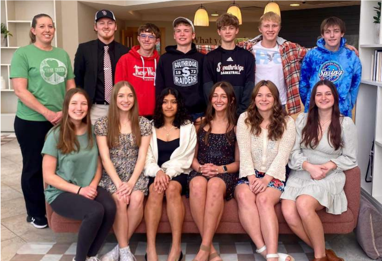
Pictured above is the Southridge swim team at their swim banquet, which was held at OFS Headquarters.