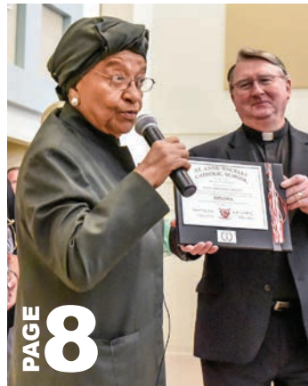
Meeting Madame President