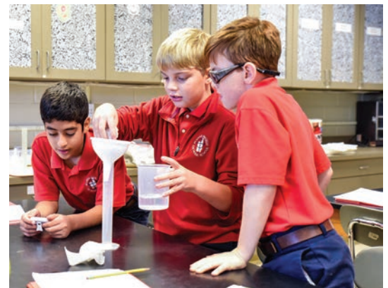
Fifth graders test the absorbency of various brands of paper towels during this Lower School Science Lab exercise.