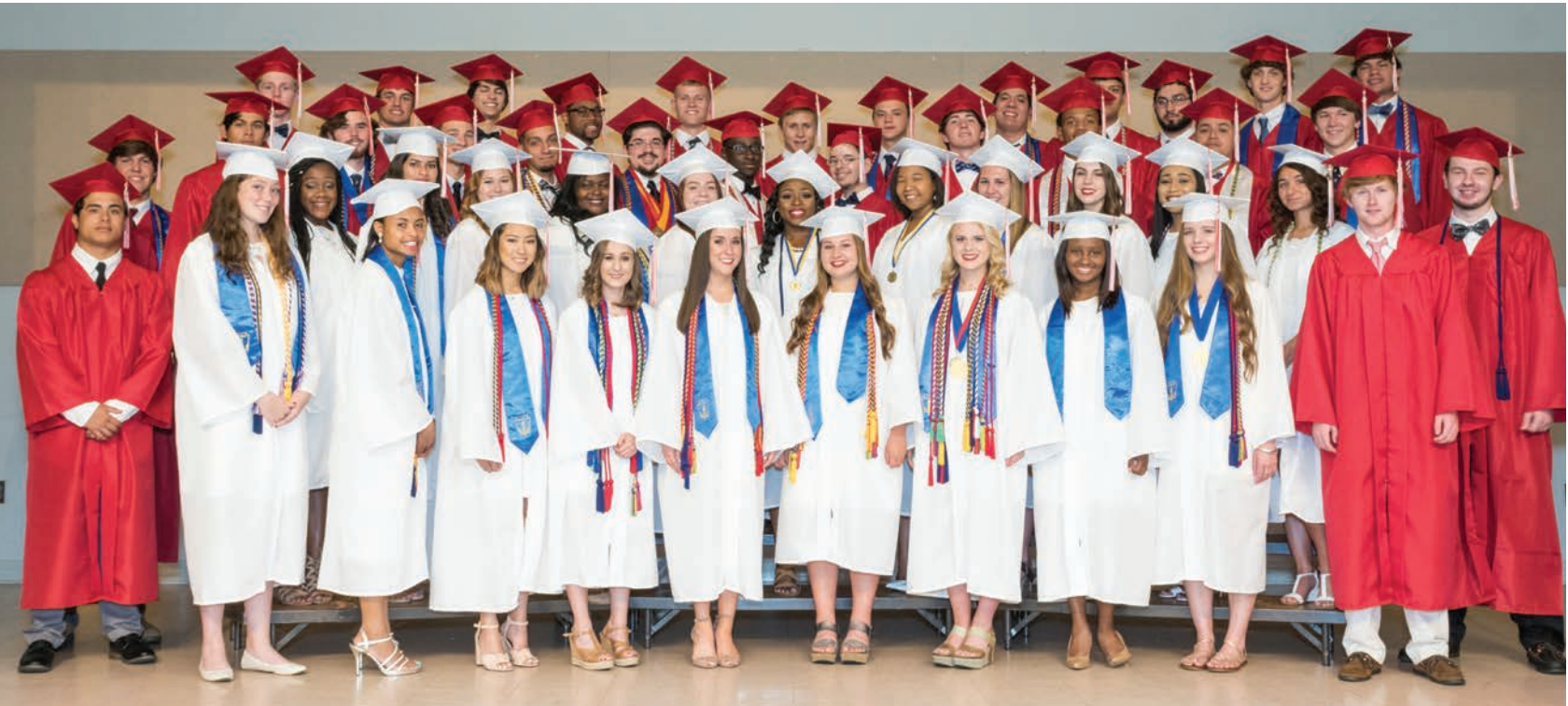
Class of 2017 group

The St. Anne-Pacelli Catholic School Class of 2017 had 100 percent college acceptance rate and earned over $1.7 million in academic scholarships for college. AP Scholar designations are awarded to students with high scores on multiple AP exams. Four students in the Class of 2017 were named AP Scholars. Four students earned a Global Competency Seal on their diploma for their efforts with World Languages in high school. These students met stringent requirements for coursework, study abroad and a capstone project.