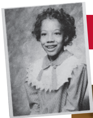
Amy Sherald's 5th grade St. Anne School yearbook photo in 1984.

Through her work, Amy Sherald (Pacelli High School Class of 1991) takes a closer look at the way people construct and perform their identities in response to political, social, and cultural expectations.