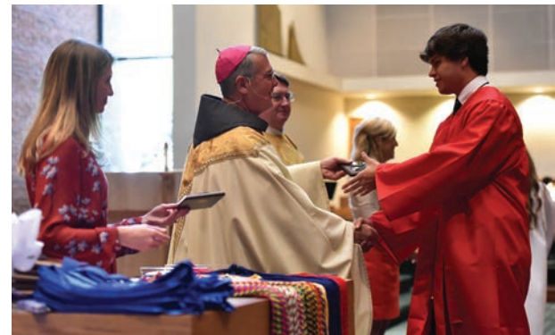
Baccalaureate Mass