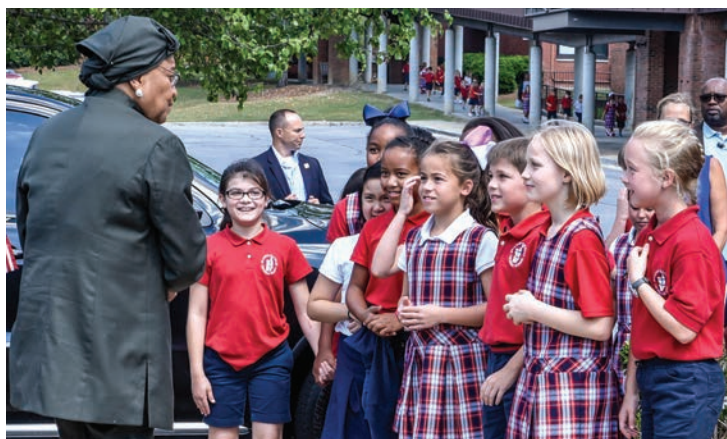
Before leaving our campus, Liberian President Ellen Johnson Sirleaf spent time talking with St. Anne-Pacelli Catholic School 4th grade students.

1 Thessalonians 5:11 says, "Therefore encourage one another and build one another up, as indeed you do." God wants us to build each other up and not tear them down. President Sirleaf definitely tries her very hardest to build others up. She is very humble and puts others before herself. She cares about everyone in her country and tries to make the best choices for everyone. President Sirleaf encourages us to find our voice and speak and let others hear our voices. One action you do might not change the entire world but it might just change somebody's life. President Sirleaf can teach us so much. So just do your best to let others hear your voice and be the one to change the world.