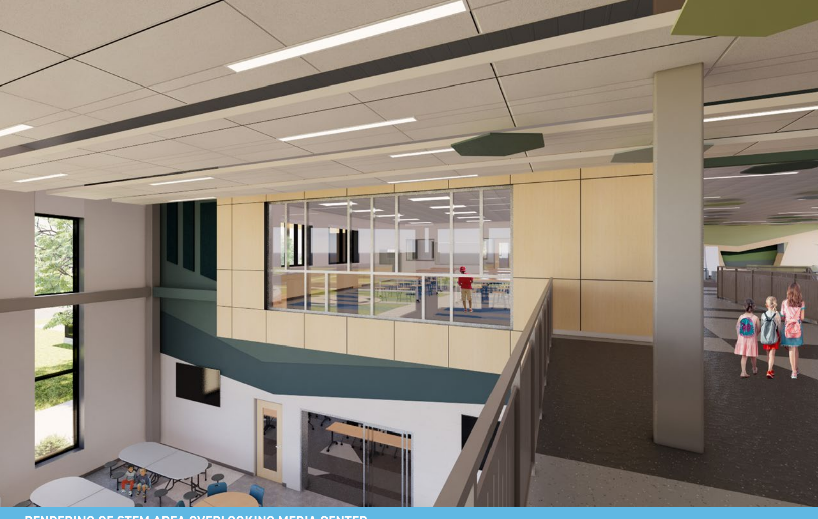
RENDERING OF STEM AREA OVERLOOKING MEDIA CENTER