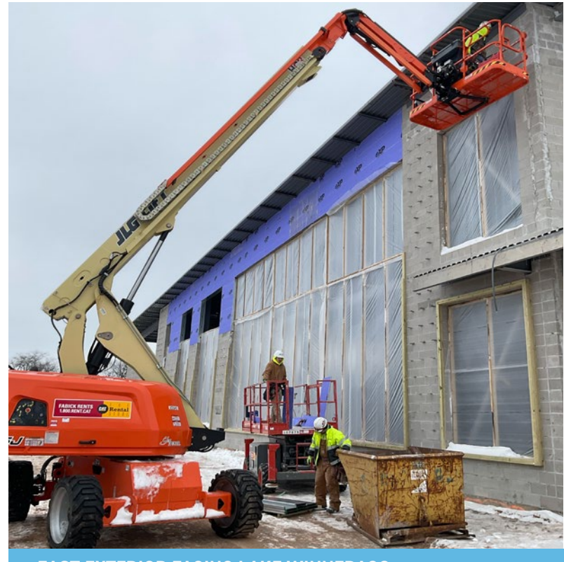
EAST EXTERIOR FACING LAKE WINNEBAGO