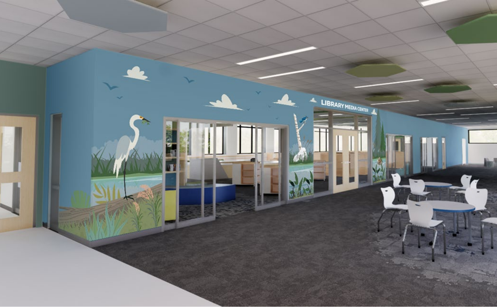
PRELIMINARY ENVIRONMENTAL GRAPHIC OF THE LIBRARY MEDIA CENTER ON THE SECOND FLOOR