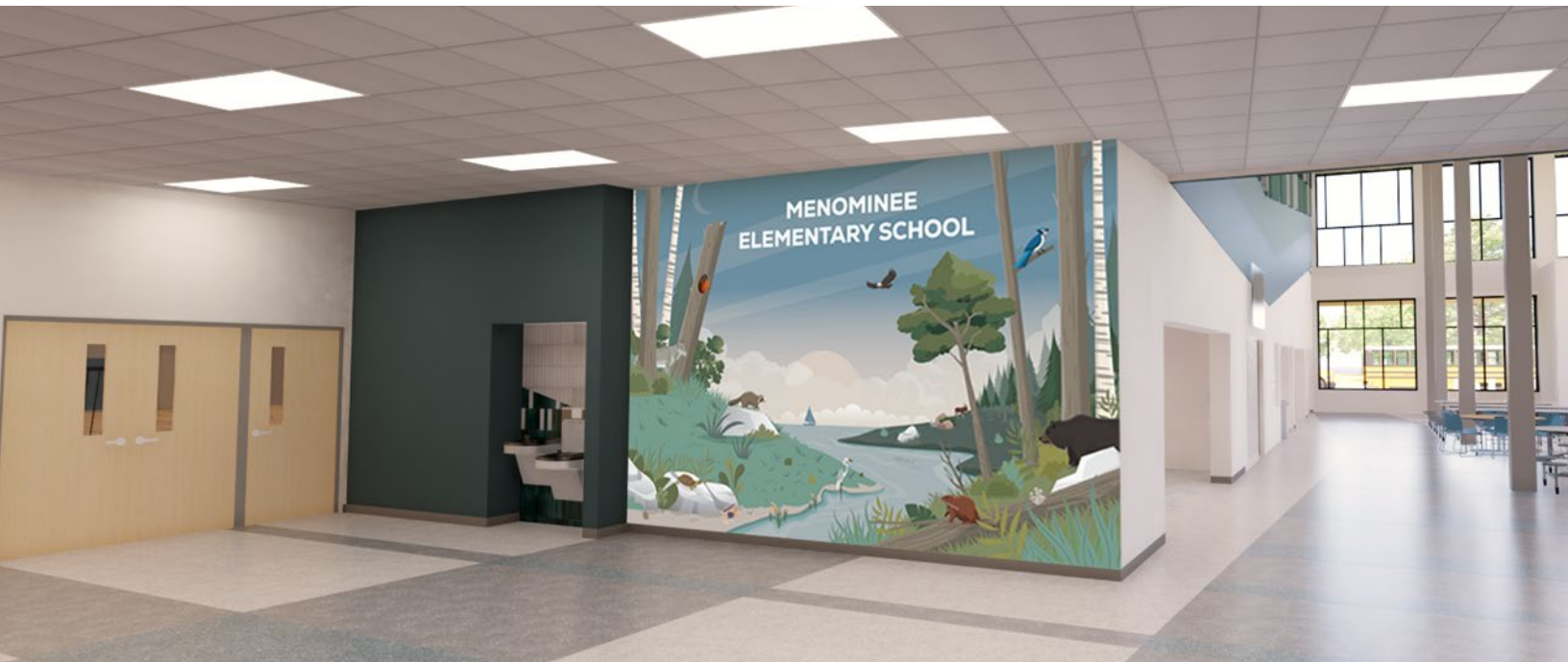
PRELIMINARY ENVIRONMENTAL GRAPHIC ADJACENT TO CAFETERIA ON FIRST FLOOR