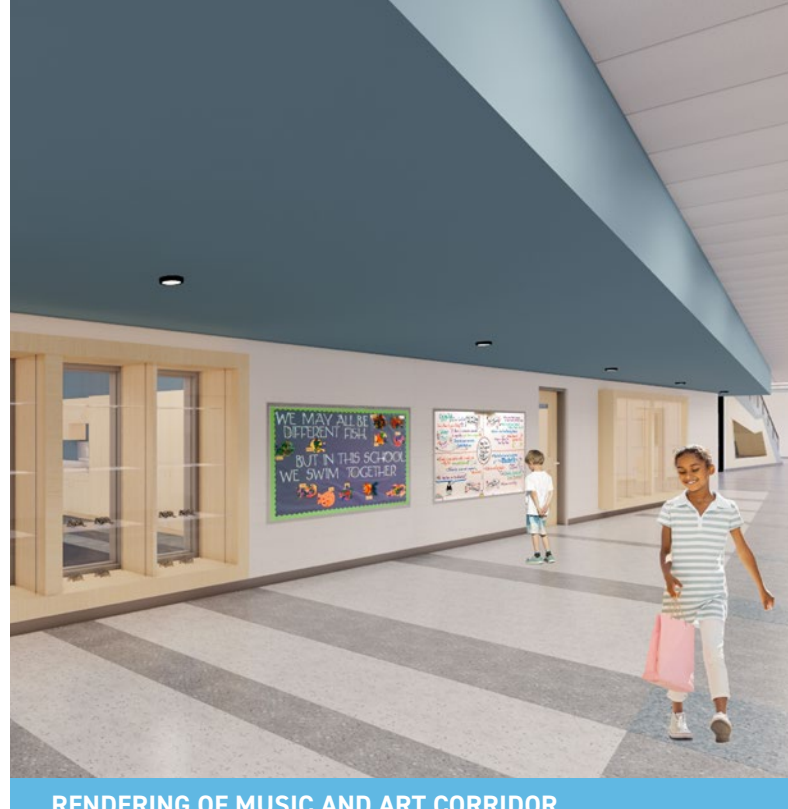
RENDERING OF MUSIC AND ART CORRIDOR