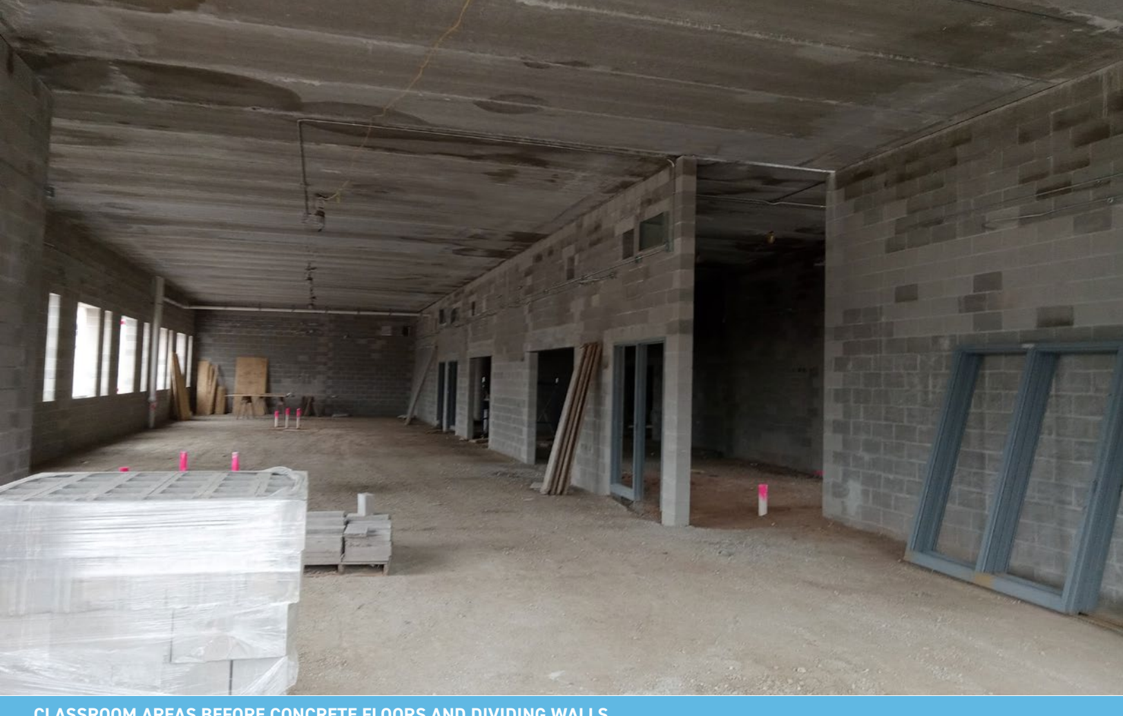
CLASSROOM AREAS BEFORE CONCRETE FLOORS AND DIVIDING WALLS