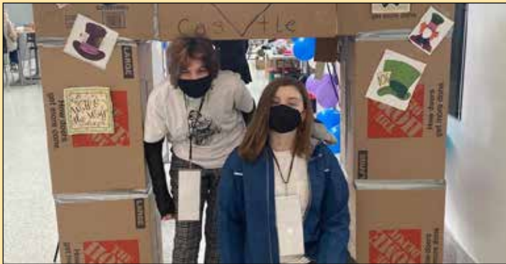
Upper Arlington High School celebrated UA Idea Week, with guest speakers and activities aimed at helping students explore their passions, engage in new perspectives and find their path.