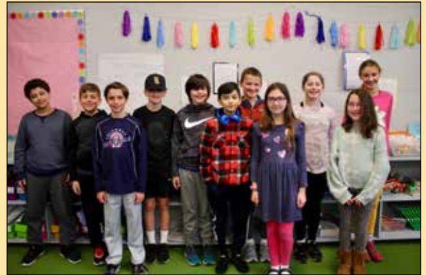
Fifth-grade students in the gifted English Language Arts class at Tremont Elementary School created podcasts to submit to a national contest through National Public Radio.