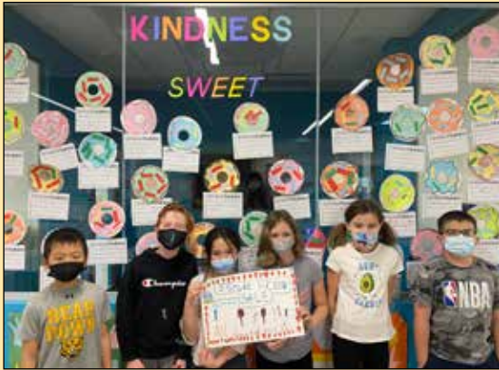
Greensview Elementary School third-grade students wrapped up a service-learning project covering math, economics and history. Their candy sale raised $1,700 for Community and Immigrant Refugee Services.