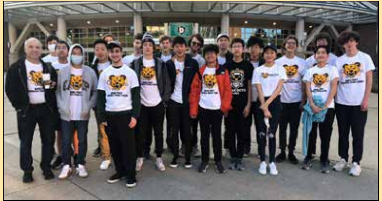
BearBots assemble! After spending several weeks building their robot, Shop Vac, the Upper Arlington High School FIRST Robotics team traveled to Cleveland in March to compete at the Buckeye Regional competition.