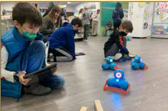
Barrington Elementary School's Passions With a Purpose project, funded by the Upper Arlington Education Foundation and the PTO, is giving third and fourth grade informal program students the opportunity to explore robotics, cooking and more.