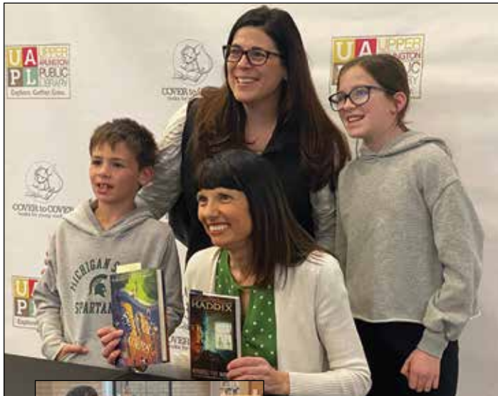
Author Margaret Peterson Haddix visited the Main Library to meet fans and talk about her latest book, The School for Whatnots .