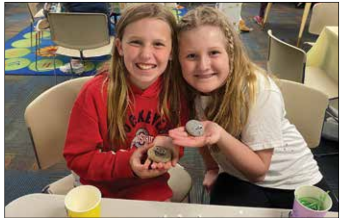
Kids made pet rocks and PEEP catapults at Lane Road.