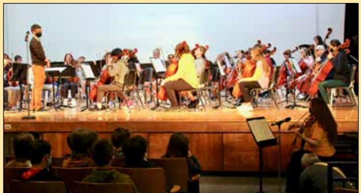
Orchestra students at the middle school and high school level had the unique opportunity to workshop with and learn from Rachel Barton Pine, an world-renowned violinist, thanks to the Upper Arlington Education Foundation.