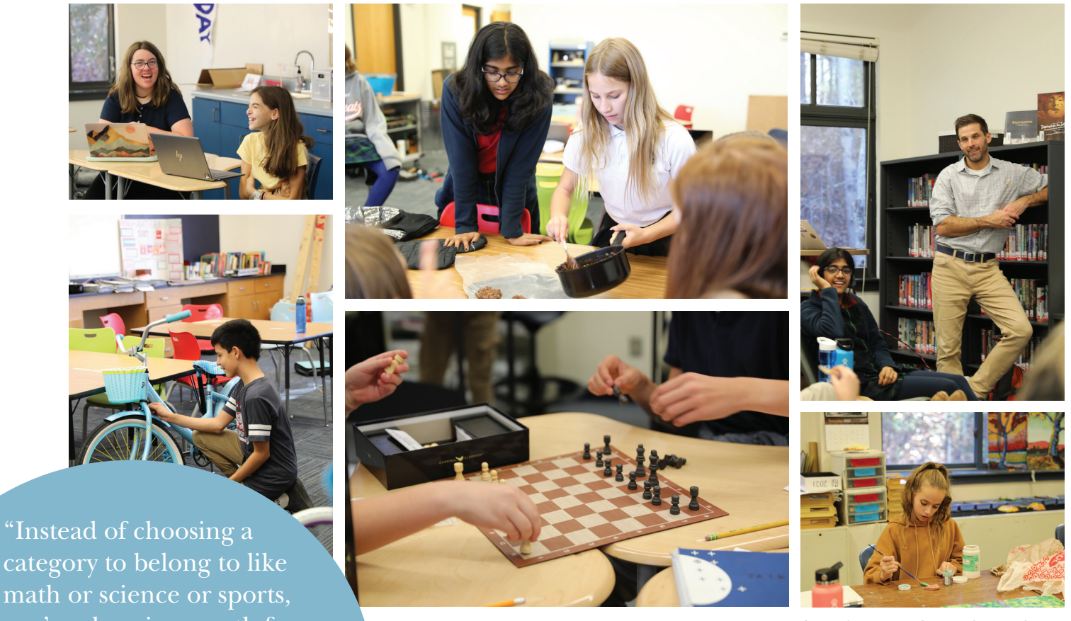
Scenes from past cooking, tinkering, chess, finance, and art mini-courses.

Every Wednesday our Middle Schoolers participate in mini-courses. These elective-style classes are designed for students to try new and different disciplines across areas of art and innovation, service and civic engagement, and outdoor and place-based learning. Students choose from an array of diverse course offerings across specific categories of learning to cultivate a well-rounded learning experience that shies away from early specialization. Through this process of curated discovery, with lessons designed to hit multiple learning targets, your Middle Schooler won't be limited to what they think they want to experience. They'll find new interests, new passions, and new ideas, so they can discover themselves through everyday learning.