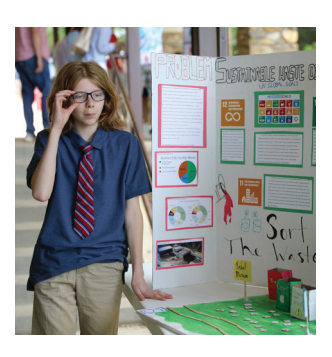
Eighth graders present their sustainable solutions to the issues in their community which they're passionate about.

Each grade level has a final Cornerstone project meant to foster their leadership abilities and equip them with the knowledge, skills, and emotional intelligence to flourish in our complex and interconnected world.