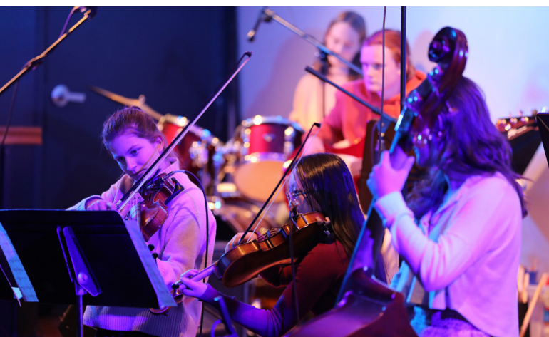
Top to bottom: Students participating in a student-written musical, varsity baseball practice, and a school concert.