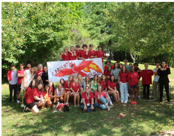
Above: New members of Cardinal House pose for a picture after the yearly House Sorting.

Teaching high school students about healthy relationships is a proactive measure that not only protects them from potential harm but also empowers them to cultivate fulfilling and respectful connections throughout their lives. Our Healthy Relationships program, led by our skilled school counselor in partnership with Our VOICE and Helpmate, equips students with essential tools to build meaningful and respectful connections. Topics covered include setting classroom expectations, understanding body language, addressing harassment, bystander responsibility, consent, and respecting boundaries, among others.