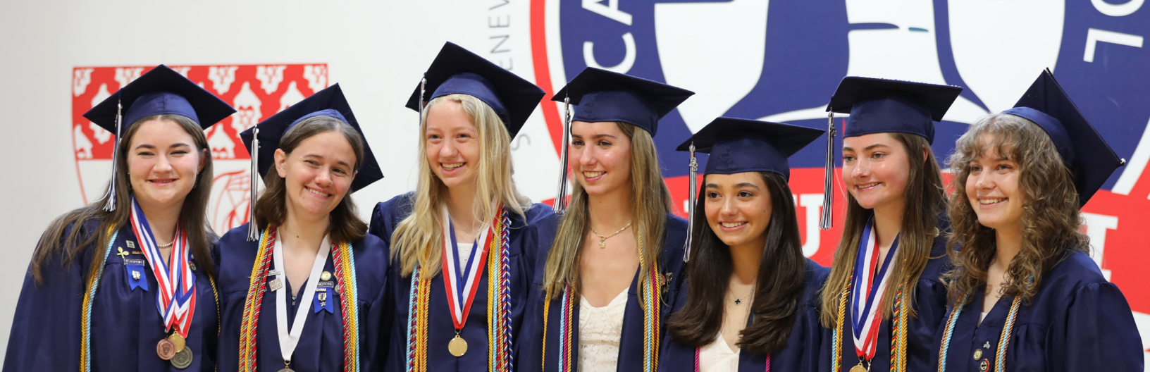
Above: Upper School seniors prepare to walk across the stage at commencement.