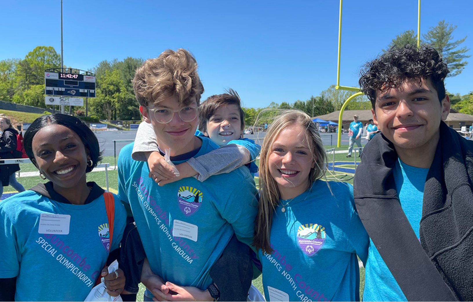
Upper School students volunteering with Special Olympics.