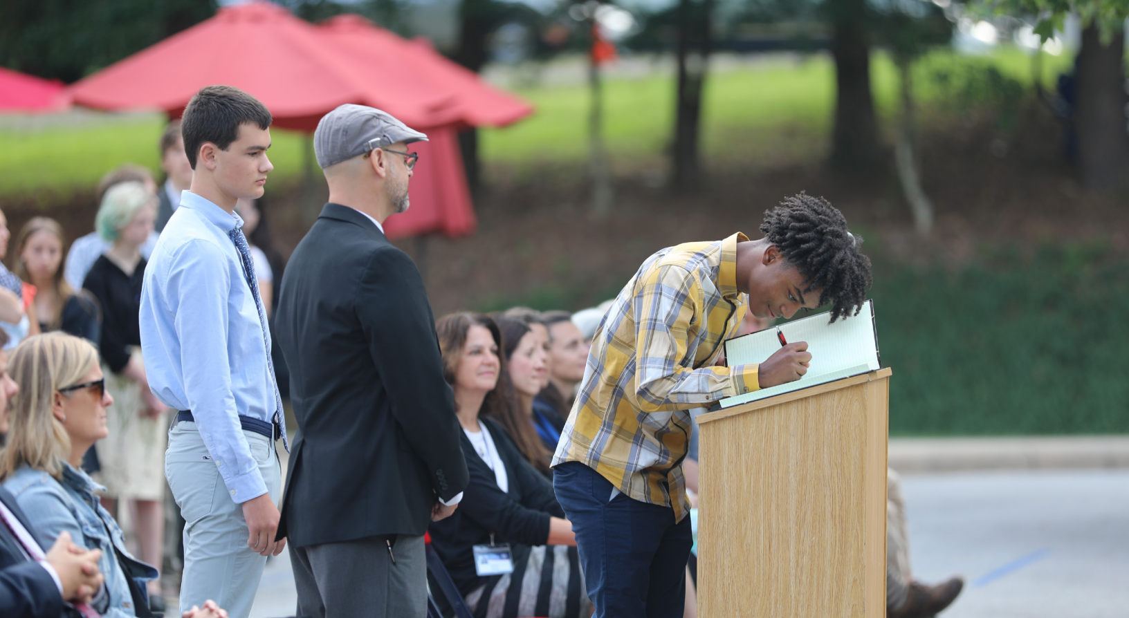
Upper School students sign the Honor Code pledge at the beginning of each year.