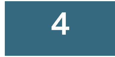
RAUG TSHEM TAWM

Lub sijhawm qhia kev xovxwm no muaj li 282 tus menyuam kawm xaiv pom zoo mus kawm ntawm yus tus kheej tom tsev.