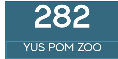
KAWM TUS KHEEJ

Lub sijhawm no, hais tias muaj 9 tus tub qhe txib mus rau tub ceev xwm vim tsis mloog lus, raug txhomkaw 5 zaug thiab tau 4 daim pib.