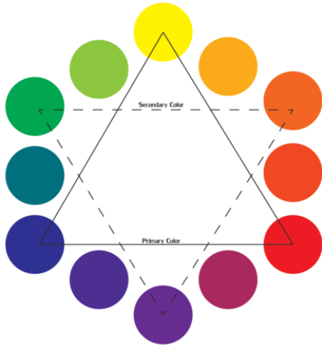
The Color Wheel

Color + white = Tint Color + black = Shade