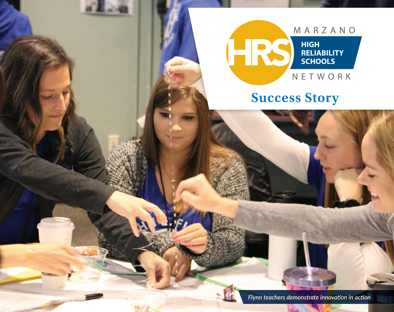
Flynn teachers demonstrate innovation in action