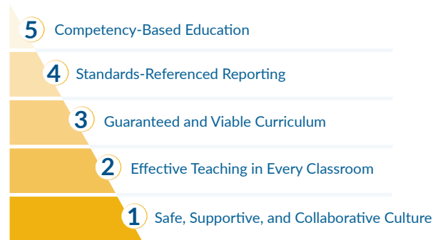
The five levels of High Reliability Schools

While Flynn is an innovation school, it’s important to note that it operates as a local community school that welcomes all students.