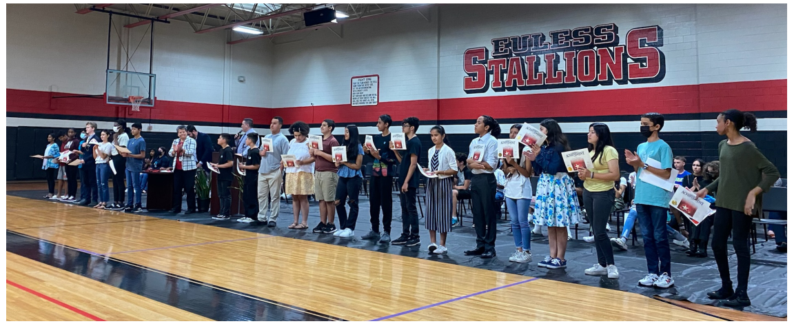
7TH GRADERS WHO EARNED ACADEMIC ACHIEVEMENT AWARDS