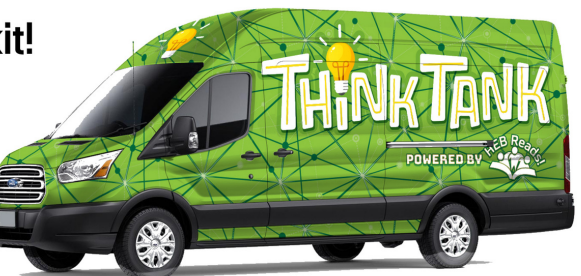
Limit 1 per child while supplies last.

Shady Oaks Elementary | 1400 Cavender Drive, Hurst Pickup: 12:00pm - 12:30pm