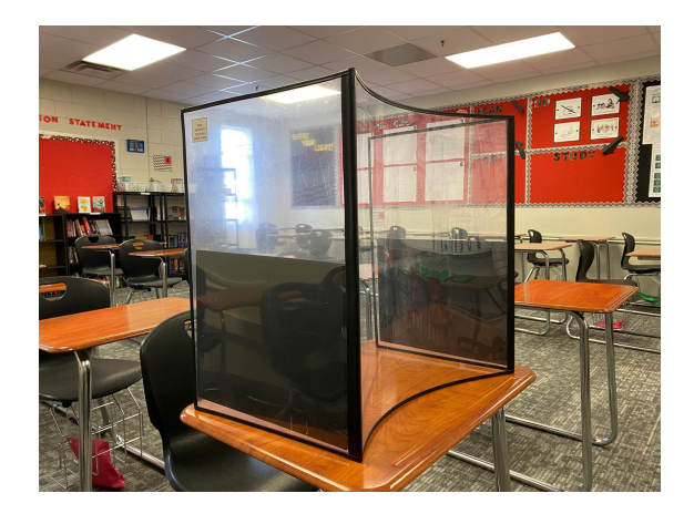
Desk shields are available for students to request in each class.

CLICK HERE TO READ HEB'S AUGUST 2021 BACK TO SCHOOL SOCIAL-EMOTIONAL WELLNESS NEWSLETTER CREATED BY THE CRISIS INTERVENTION & PREVENTION TEAM