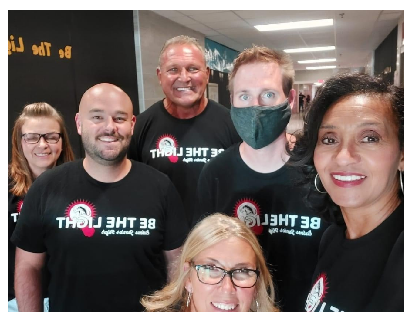
8TH GRADE TEACHERS IN B HALL CELEBRATING A SUCCESSFUL FIRST DAY BACK

The latest news and updates from Euless Junior High