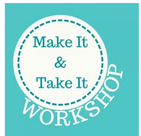
For Adults Thursday at 6 PM

Click here to see additional community services offered at the Euless Public Library and to get to their full calendar of events