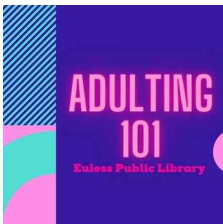
For Teens Monday at 9 PM