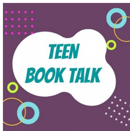
For Teens Thursday at 9 PM