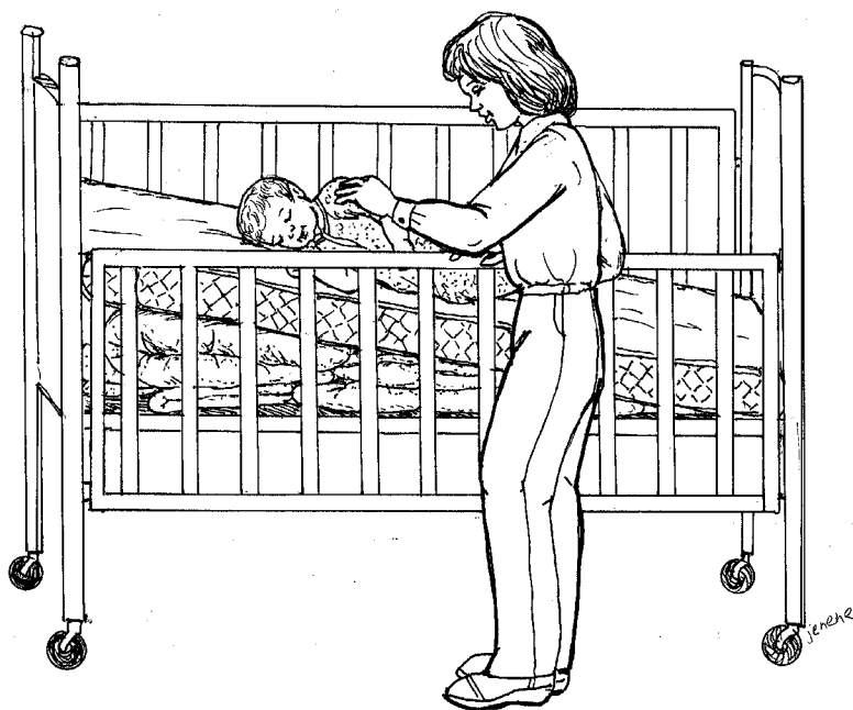
Picture 3 Raise the head of your child's bed by placing rolled blankets under the mattress.

If you have any questions, be sure to ask your doctor or nurse, or call _____.