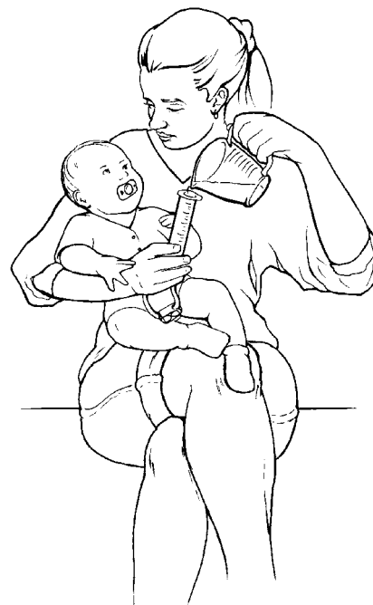
Picture 1 Feeding your child through the gastrostomy button.