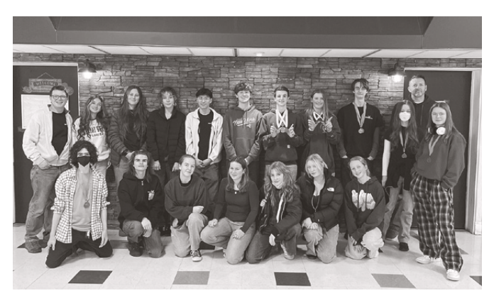
Onteora High School's Science Olympiad team at the Mid-Hudson Regional tournament on February 3.

This year, there was an exciting lineup of engineering events, including "Flight," a plane-building and flying challenge; "Air Trajectory," which involves building and