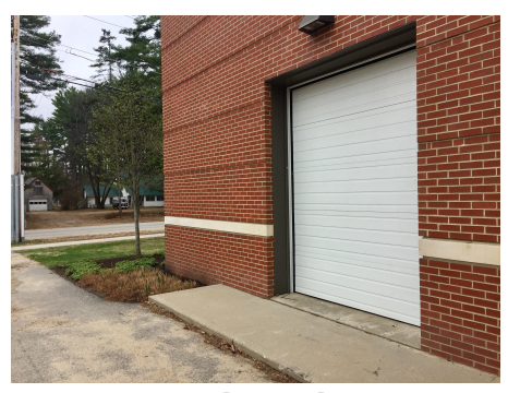
Stage-Level Loading Door