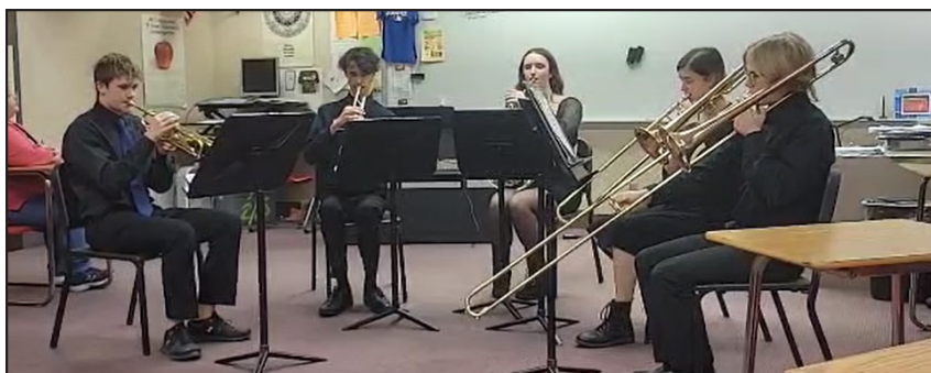
Pictured above is the CHS brass quintet who received a silver rating recently.