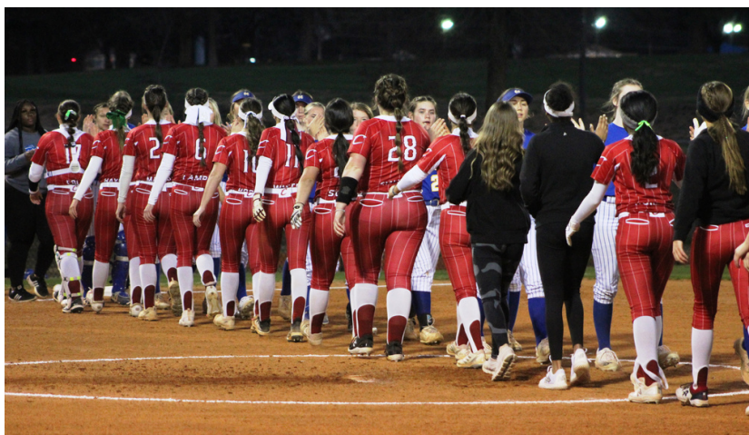
Below: When it was all over, Crockett had a season-opening 7-1 win, ready to return to Union Tuesday evening to face Scotts Hill.