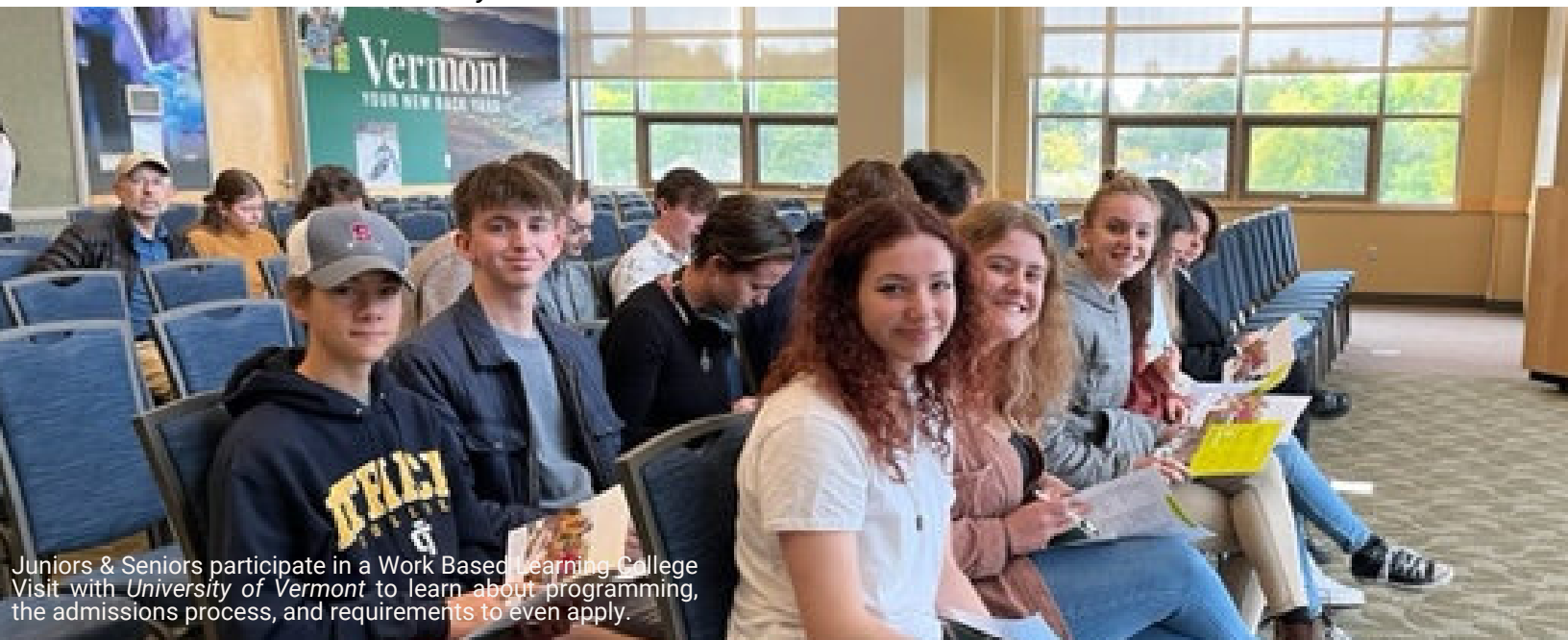
Juniors & Seniors participate in a Work Based Learning College Visit with University of Vermont to learn about programming, the admissions process, and requirements to even apply.