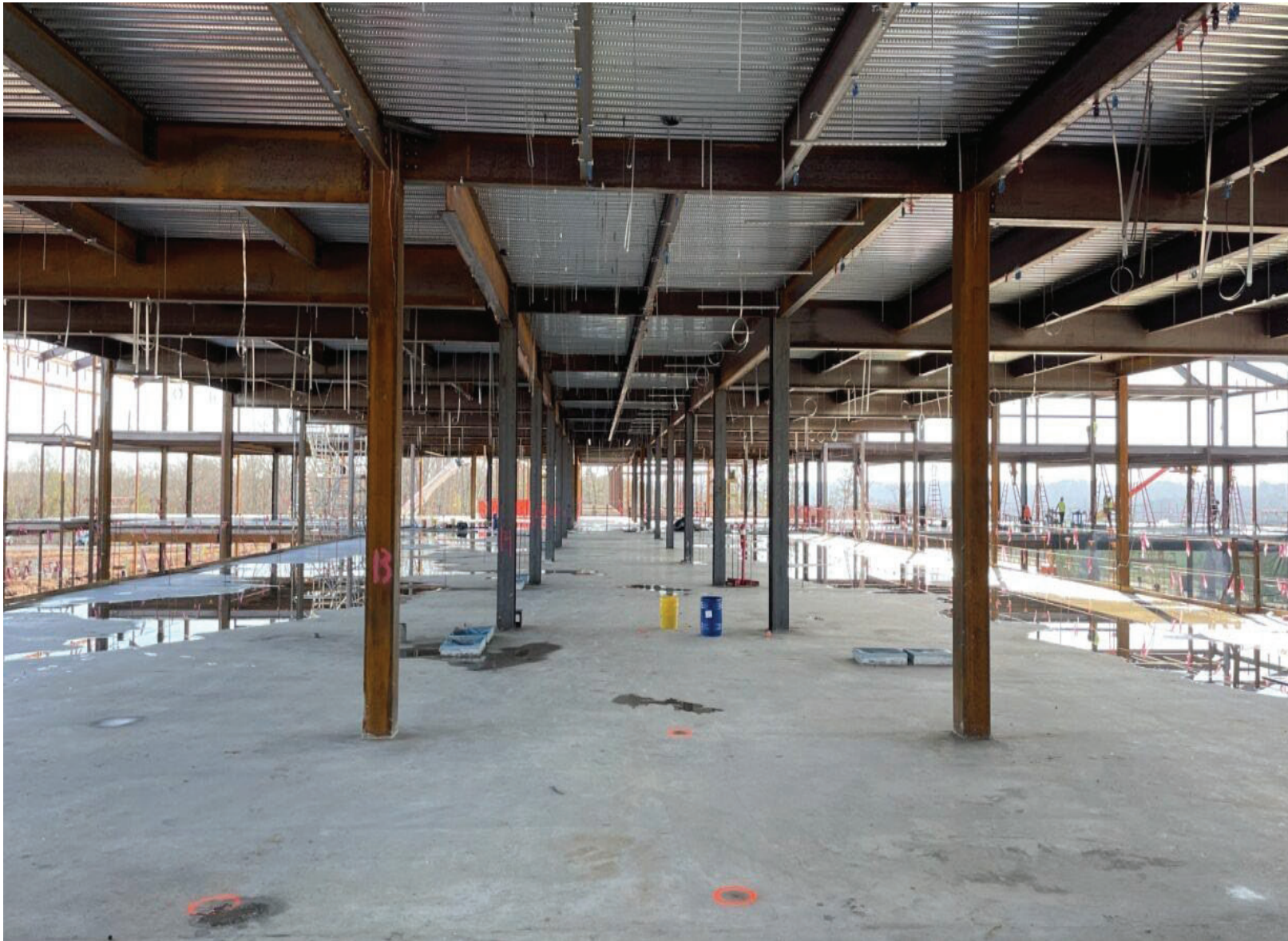
First Floor ~ Main Academic Bldg.