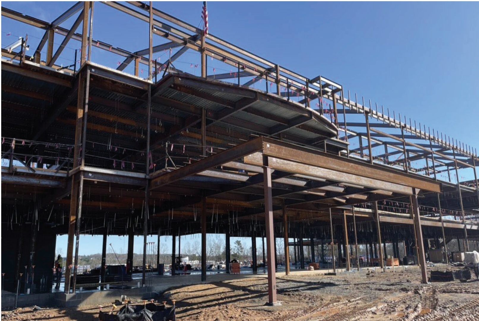
Main Entrance Canopy