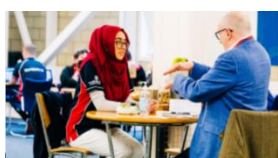
Spotlight on Careers Explore apprenticeship and