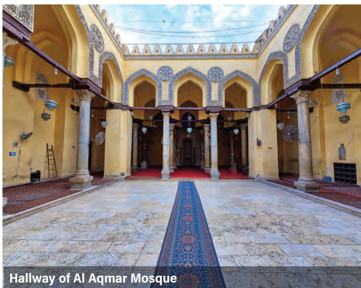
Hallway of Al Aqmar Mosque

Check out after breakfast and transfer to Cairo International Airport for flights homeward. (B)