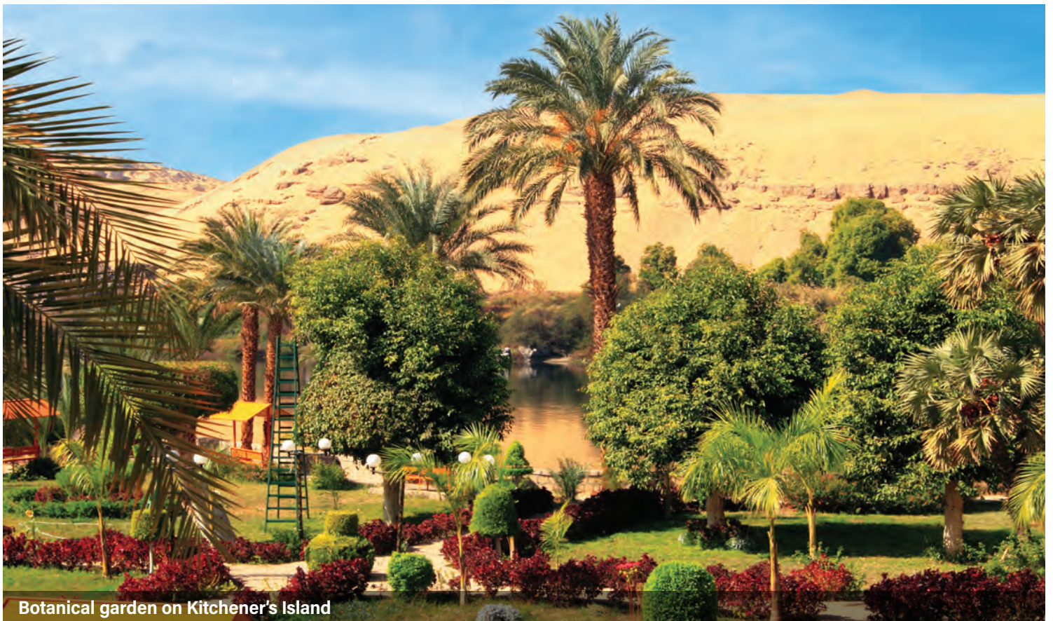
Botanical garden on Kitchener's Island