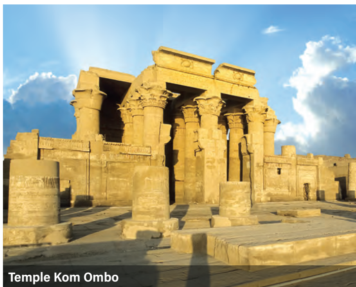
Temple Kom Ombo

Throughout history, Egyptians have referred to their country as Umm Ad Dunya, "Mother of the World," because of their homeland's remarkable achievements in religion, culture and science. We start our discovery of this fabled land in Cairo, Egypt's most important city. Our representative will meet you at the airport and assist you through immigration and customs formalities. You will also be joined by our experienced Thalassa Journeys Trip Director, who will accompany you throughout your time in Egypt. Transfer by coach to the Steigenberger Pyramids Hotel , located near the Pyramids at Giza, home for the next three nights. (D)