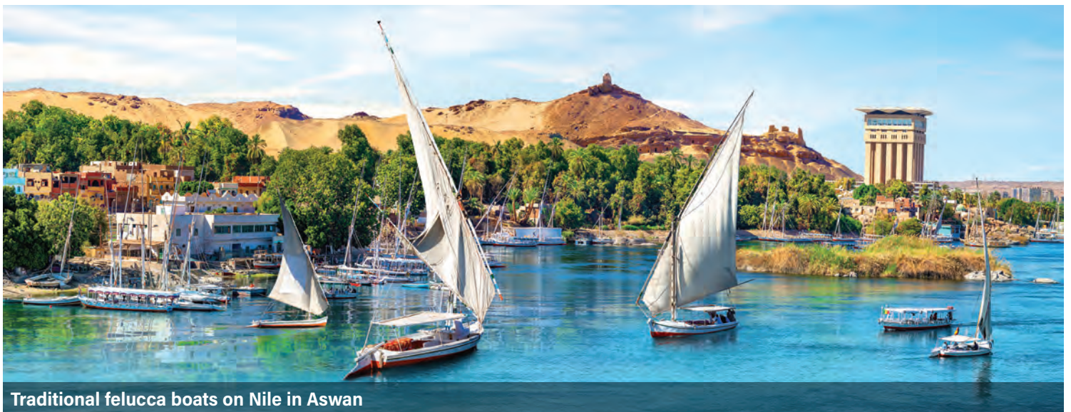
Traditional felucca boats on Nile in Aswan

This morning, Regent calls at Kom Ombo for a visit to a temple that is unique in Egypt for the fact that it is dedicated to two different deities. Two nearly identical sets of halls, courts and sanctuaries line each side of the complex. The southern half of the temple was dedicated to the crocodile god Sobek, god of fertility and creator of the world, while the northern part of the temple was dedicated to the falcon god Haroeris. Over lunch, sail to Edfu to visit one of the best preserved of all Egyptian temples. The inscriptions on its walls provide important information on language, myth and religion