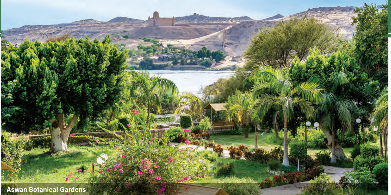
Aswan Botanical Gardens

entrance. Beneath these giant figures are smaller statues depicting Ramesses' conquered enemies: the Nubians, Libyans, and Hittites. The structures were created, at least in part, to celebrate Ramesses' victory over the Hittites at the Battle of Kadesh in 1274 BC. In the 1960s some remarkable creative engineering saved the temple complex from the rising waters of the Nile caused by the erection of the Aswan High Dam. Return to Aswan for an afternoon at leisure, with lunch and dinner served at the hotel. (B,L,D)