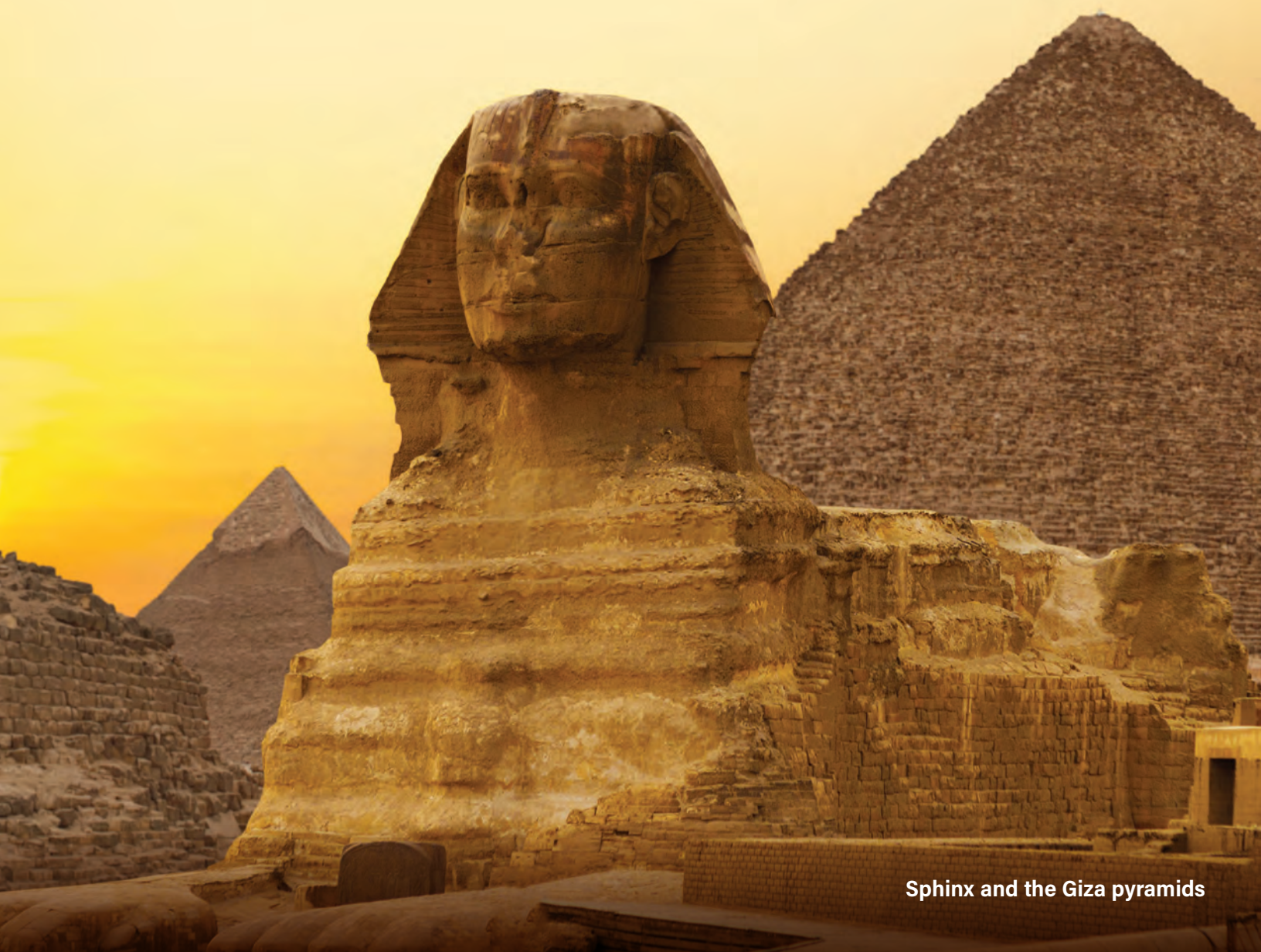
Sphinx and the Giza pyramids