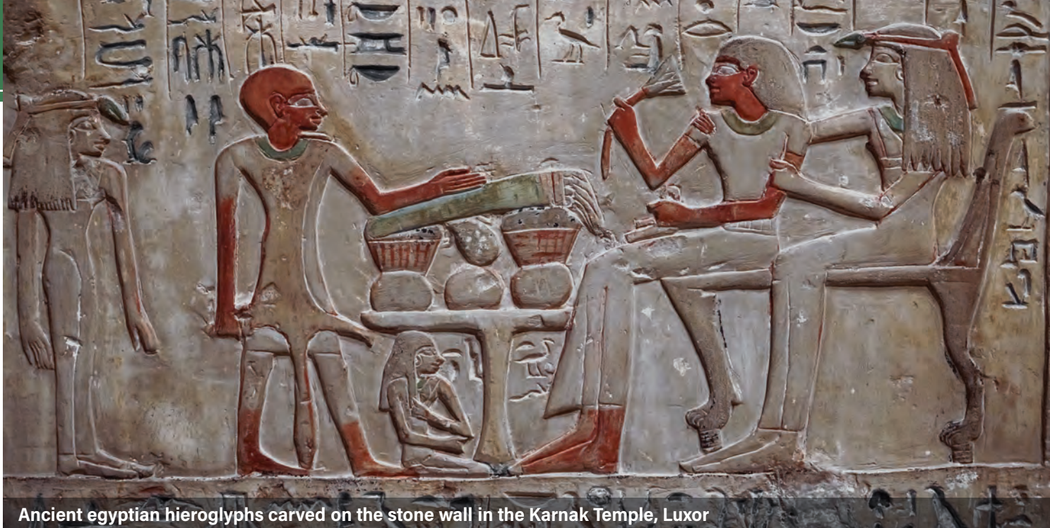
Ancient Egyptian hieroglyphs carved on the stone wall in the Karnak Temple, Luxor

during the Greco-Roman period. Explore the temples and learn more about ancient Egypt's most significant deities. Return to the ship and set sail for Luxor. (B,L,D)