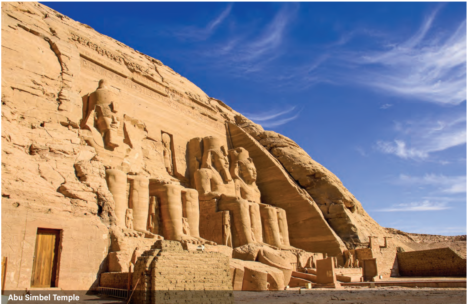
Abu Simbel Temple