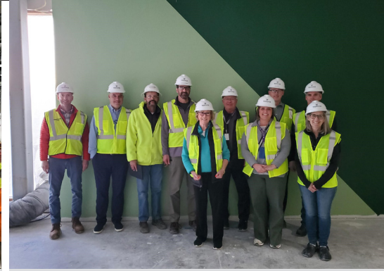
Board of Education Tour