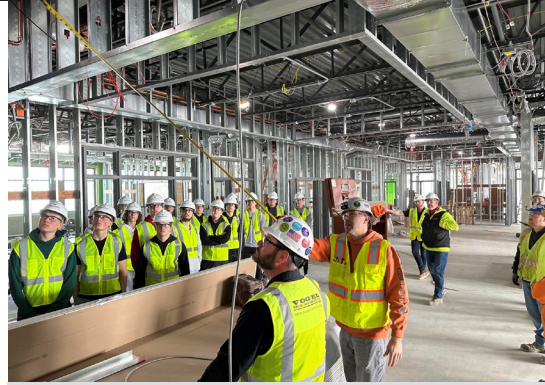
Construction II Students Tour