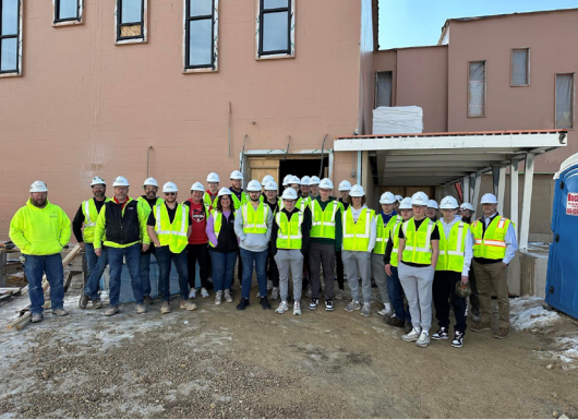
Construction II Students Tour