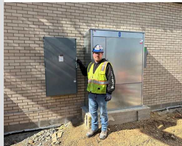
Electricity to the whole campus

For questions about the facilities design/construction process: