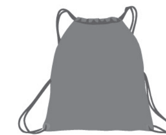
DRAWSTRING/ CINCH BAG