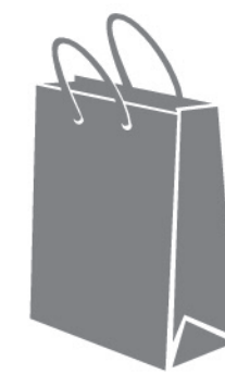
REUSABLE GROCERY TOTE