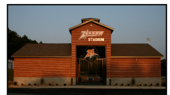
Zizzer Stadium Gate, Concession & Restrooms