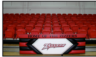
Gym Stadium Seating, Scorers' Table