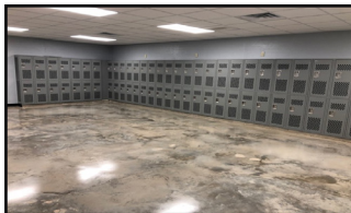
Cross Country / Track Field House Interior