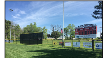
Baseball Field Fencing and Scoreboard