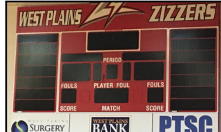
Gym Stats Board