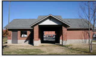
Soccer/Tennis Concession, Restrooms & Gate