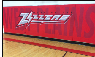
Gymnasium Wall Padding