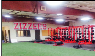
Weight Room and Weight Equipment