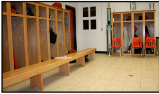
Baseball/Softball Field House Interior