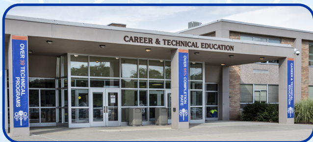
Career and Technical Education at the Amy Bull Crist Area Education Center 53 Gibson Road, Goshen, NY 10924