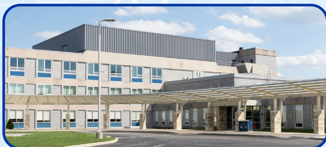
Career and Technical Education at the Regional Education Center at Arden Hill 4 Harriman Drive, Goshen, NY 10924