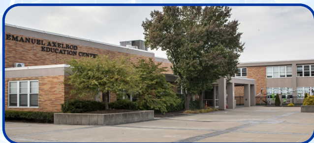
Emanuel Axelrod Education Center at the Amy Bull Crist Area Education Center 53 Gibson Road, Goshen, NY 10924