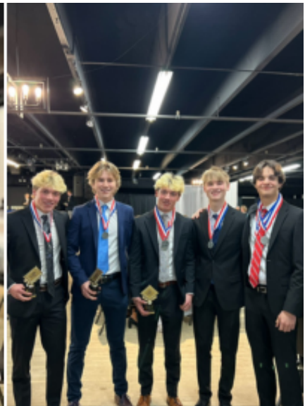
Business Growth Qualifiers