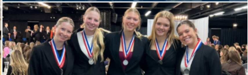
Sports Marketing Qualifiers