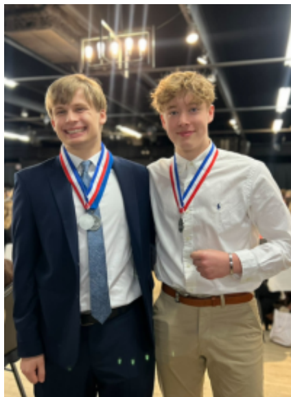
Business Services Roleplay