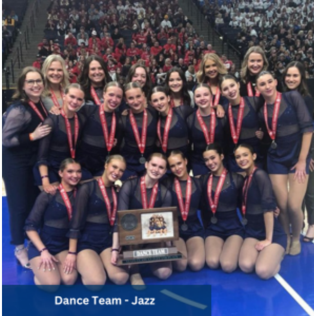
Dance Team - Jazz