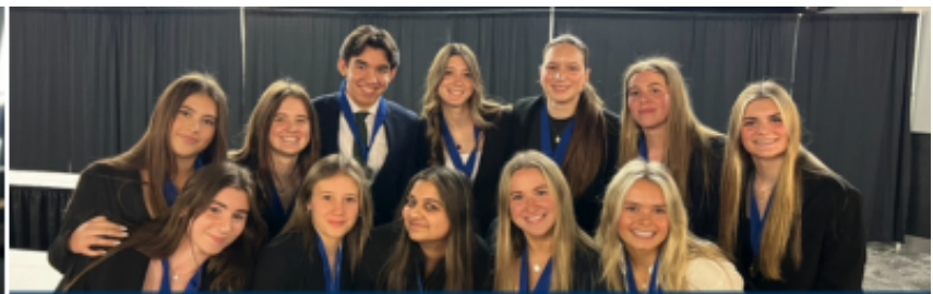
Five Teams Advance in the International Business Plan Event