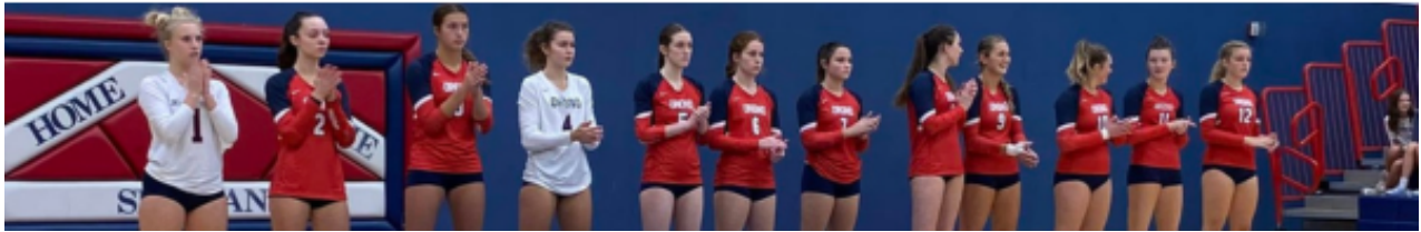
Orono Spartans shine in Boys Soccer, Football and Volleyball.