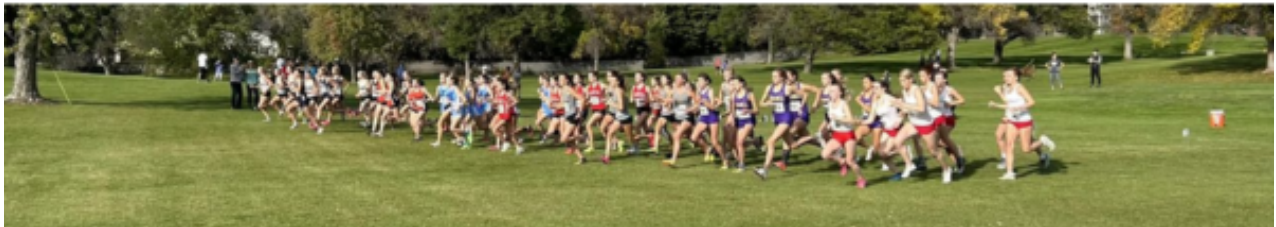
Boys Cross Country, Girls Swimming & Diving, and Girls Cross Country give it their all.