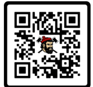
Parent/Player Sportz Quiz