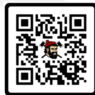
Home Game Livestream

Some away games may also be livestreamed, we do our best to share those links through the SportsYou App.