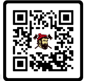
Athletics and Activities Website