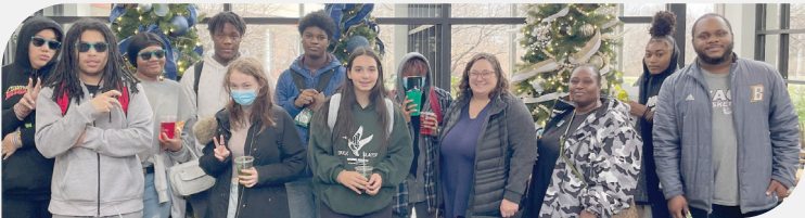
BATTLE HIGH SCHOOL STUDENTS VISITED VETERANS UNITED AND HEARD FROM VU STAFF ABOUT CAREER OPPORTUNITIES FOR HIGH SCHOOL GRADUATES.