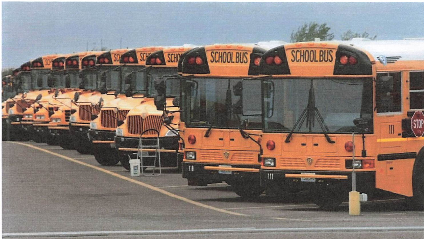
A Kennewick school union treasurer pleaded guilty to embezzling dues.